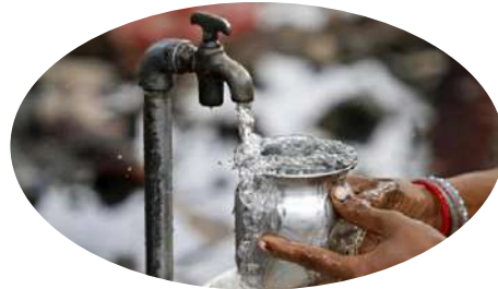
Municipal treated water By Chlorination

TDS ( Total Dissolved Solids ) Water with less than 500 ppm